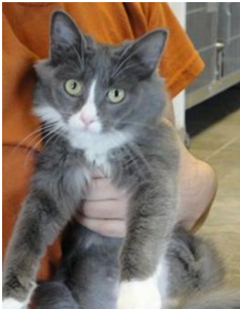
"Dori Ann " female Domestic Med Coat