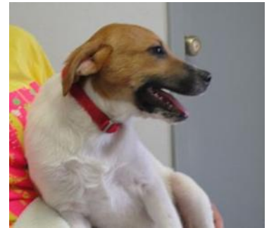
"Brandy" female Red Heeler/Fox Terrier mix