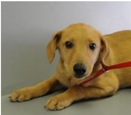
"Ranger" male baby Lab/Heeler mix