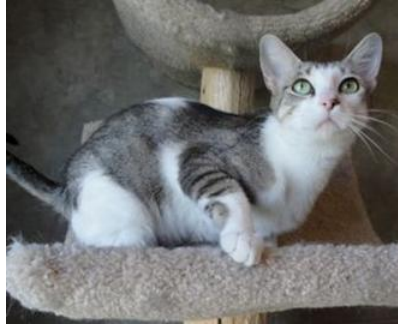
"Emme Lou" female White & Grey Tabby