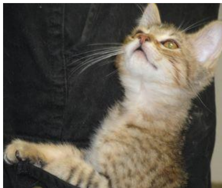
"Paul" male Domestic Short Hair mix