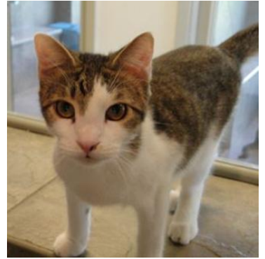
"John" male Domestic Short Hair/Tabby mix