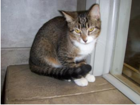
"Alisa" young female Short Hair mix