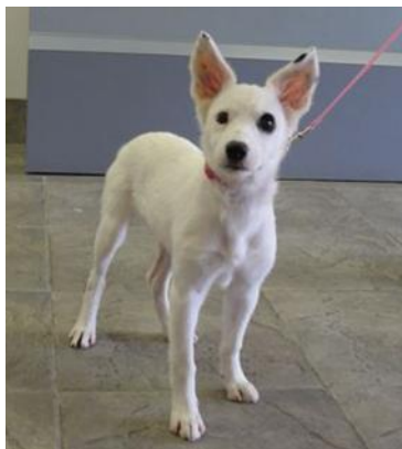
"Daisy" female young Terrier mix