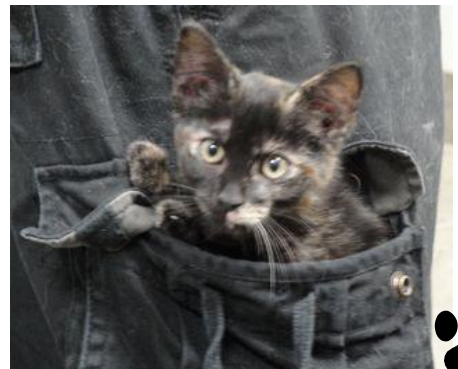
"Kora" baby female Torti