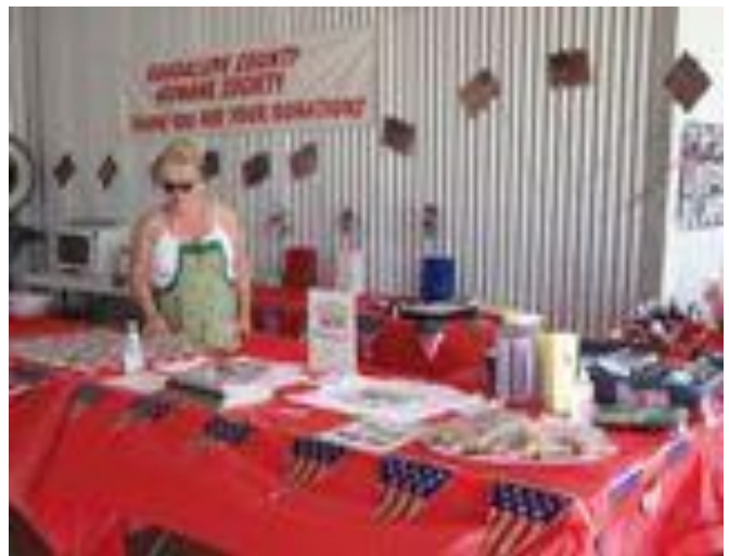
Our GCHS “PAWTY” Booth