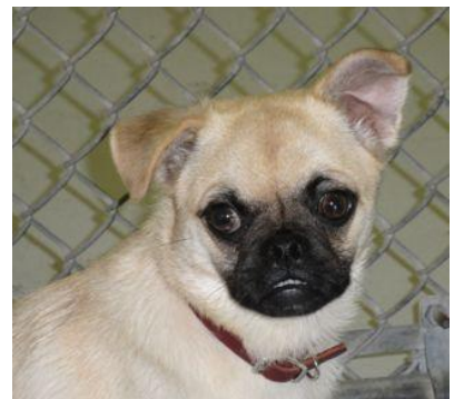
"Steve" male Chihuahua/Pug mix