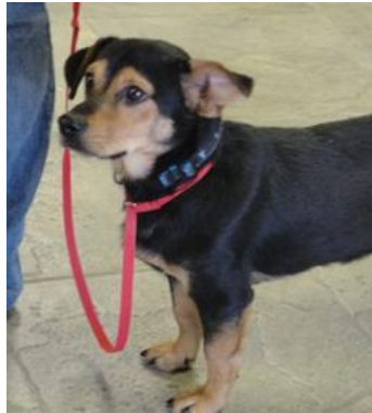
"Georgie" male Corgie mix