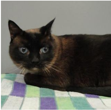
"Zorro" male Seal Point Siamese